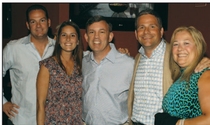
Special Thanks to The Dr. Theodore A. Atlas Foundation